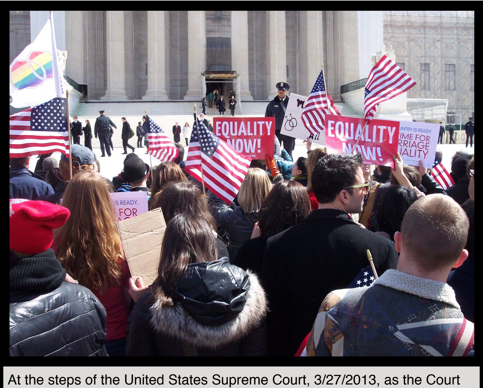
heard oral arguments in U.S. v. Windsor.

profession. Bi-national couples can now apply for green cards (permanent residency). Scientists who work for the federal government, including NASA and the NSF, can now obtain health insurance for a same-sex spouse. From taxes to death benefits, health insurance to daycare, immigration to ethics laws, the end of S3 of DOMA has profoundly improved the lives of US scientists who are lesbian, gay, bisexual, or transgender (LGBT). Here, we highlight several real-world examples of how DOMA's demise has improved the lives and careers of US astronomers.