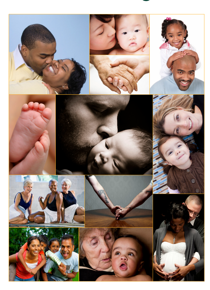
We believe the success of our missions depends on the well-being of those who support them